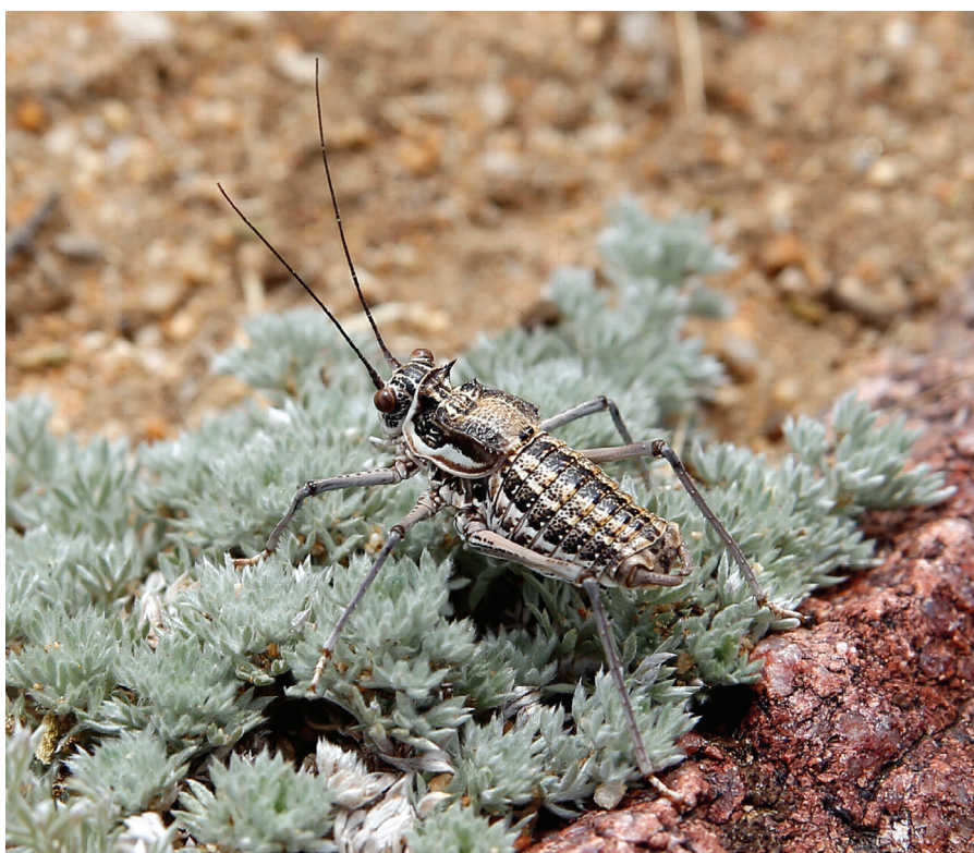
Fig. 3. Zichya baranovi baranovi (Bey-Bienko), male, Uvs-Intremountain Basin, Tsuger-El, sandy semi-desert.

MATERIAL. Tuva: W Tannu-Ola Mts., 4 km E Khandagajty settlement, 50°45'N, 92°09'E, 1150–1200 m, southern slope and piedmont plain, stony semi-desert with Nanophyton grubovii , 24.VIII 1978, 1 ♂ (MS); W Tannu-Ola Mts., W Khandagajty settlement, 50°43'N, 92°04'E, 1150–1250 m, northern slope and piedmont plains, semi-desert with Nanophyton grubovii , 24.VIII 1978, 1 ♂, 1 ♀ (MS); N Uvs-Nuur Intermountain Basin, Iribitej River, 50°44'N, 93°08'E, 938–973 m, 24.VI 1978, piedmont plain, stony semi-deserts with Nanophyton grubovii , 2 ♂ (larvae), 2 ♀ (larvae) (IS, MS); the same locality, 30.VII 1978, piedmont plains and terraces, stony semi-deserts with Nanophyton grubovii , 1 ♂, 4 ♀ (MS); NE Uvs-Nuur Intermountain Basin, Khol-Oozhu River, 50°43'N, 94°17'E, 930 m, piedmont plain, lower part, meadow, semi-desert with Nanophyton grubovii , 16.VIII 1978,